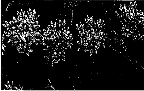
A gentler answer: Large orange flowers of Asclepias tuberosa , or butterfly weed, are dependable summer bloomers and not palatable to deer. This member of the milkweed family blooms from July through September.